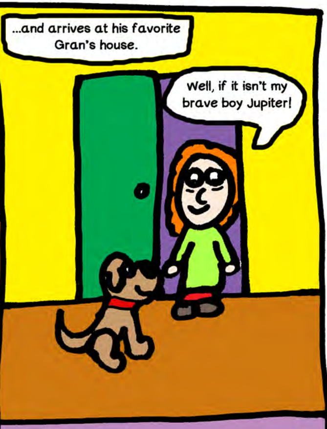
...and arrives at his favorite Gran's house.