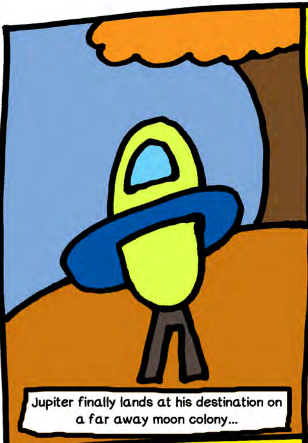
Jupiter finally lands at his destination on a far away moon colony...